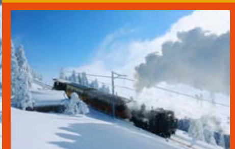
4 Hergiswil – Vitznau – RIGI