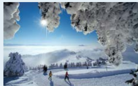
Easy walk to the Chänzeli