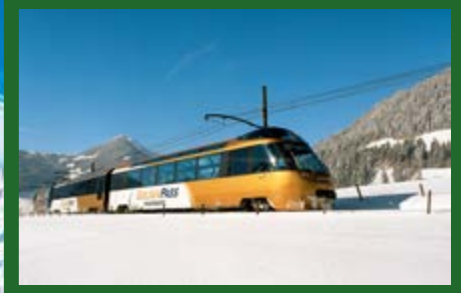
1 Hergiswil – Interlaken – GRINDELWALD