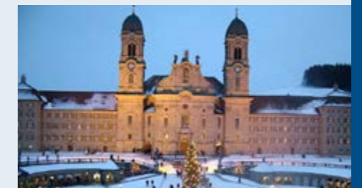
The square in front of the monastery, Einsiedeln