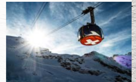
Titlis Rotair – the cable car rotates a full 360° as it climbs.