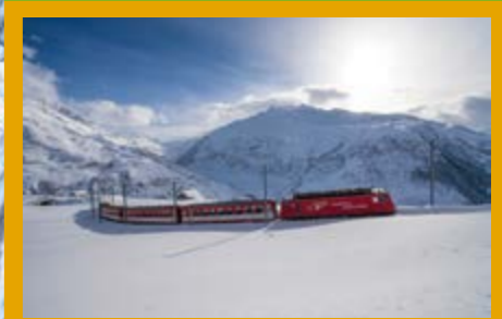
3 Hergiswil – Goschenen – Andermatt – OBERALPPASS