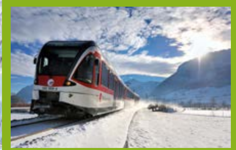
2 Hergiswil – Engelberg – TITLIS